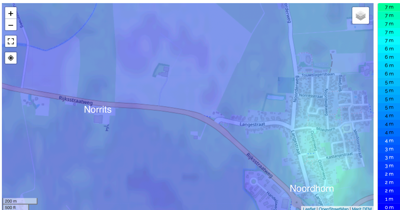
Noordhorn, Westerkwartier, Groningen, Nederland (53.26721 6.39105)

The ground in the north of the Netherlands is open and flat. Just a few metres of height differences characterise the mostly agricultural terrain. Today drainage is near perfect. For 1581 it is described as boggy and rough.